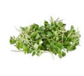
BASIL THAI ORIGINAL