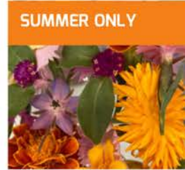
EDIBLE FLOWERS MIX