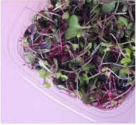
EVERYDAY MICRO MIX