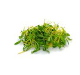
SWISS CHARD YELLOW