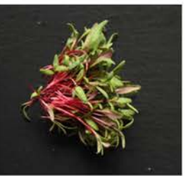
SWISS CHARD RED