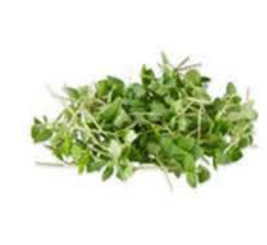
BASIL THAI SIAM