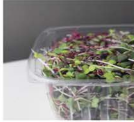
HEARTY MIX FOR PLATE VOLUME