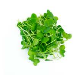
BROCCOLI RAAB (RAPINI)